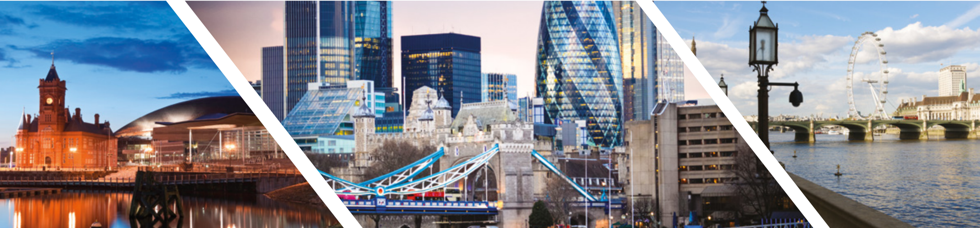
London City Centre ▲