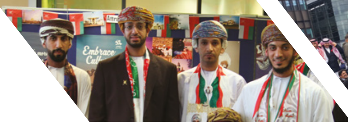
Student representatives from Oman ▲

If you follow a faith or want to explore your spirituality, the city centre's square mile offers churches, mosques, gurdwaras and temples.