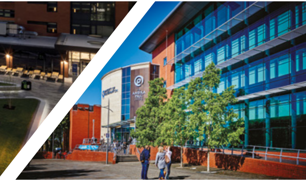
▼ Lord Swraj Paul Building, City Campus