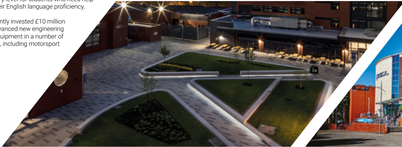
▲ Courtyard, City Campus