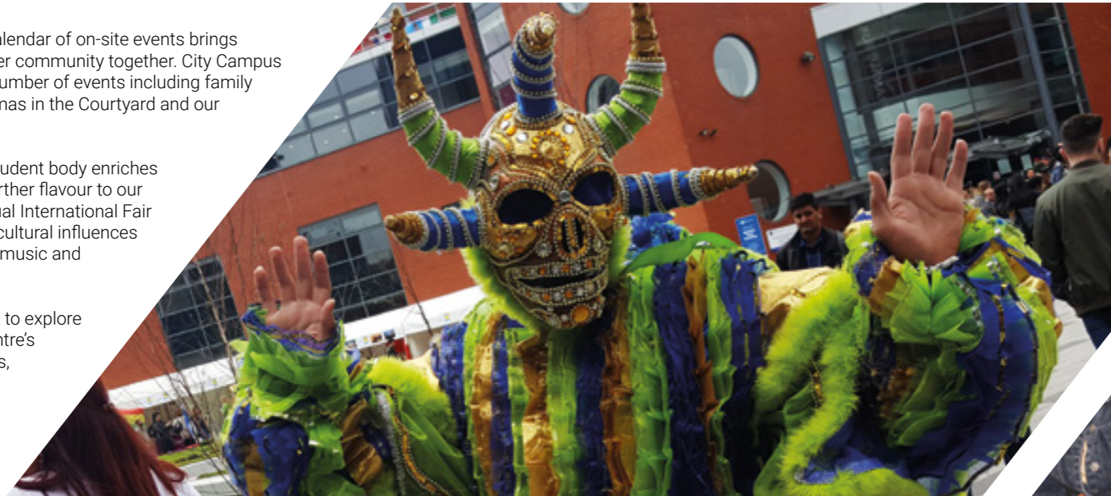
▼ Dancers enjoying Courtyard celebrations