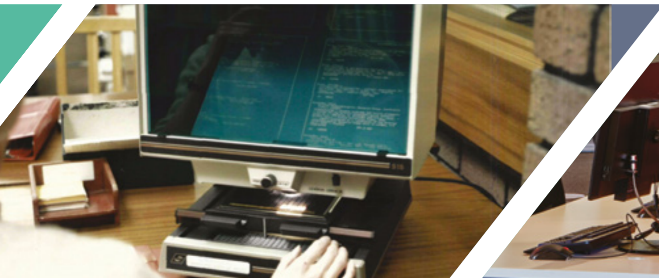
▼ Information searching on microfiche