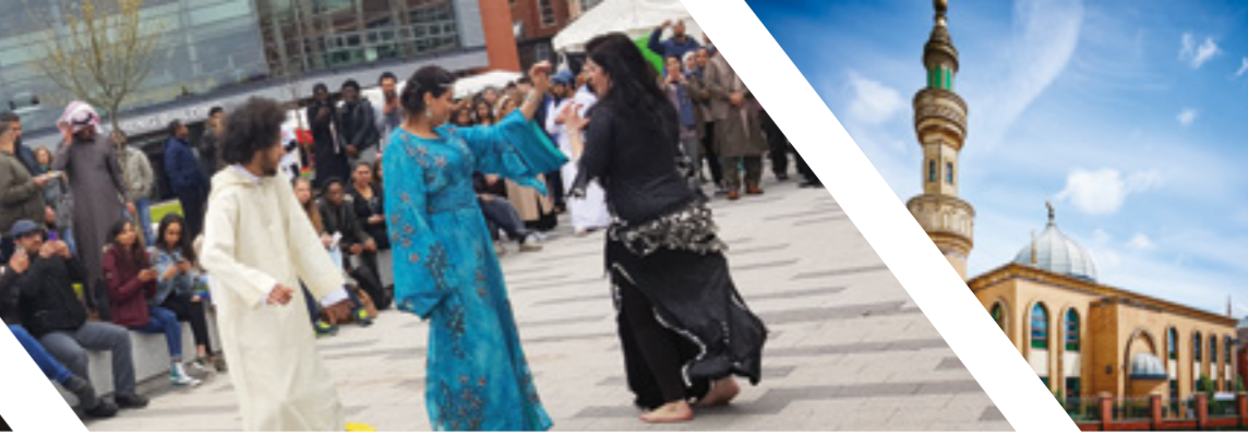
▲ International Fair