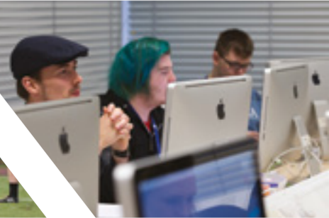
Mac labs ▲