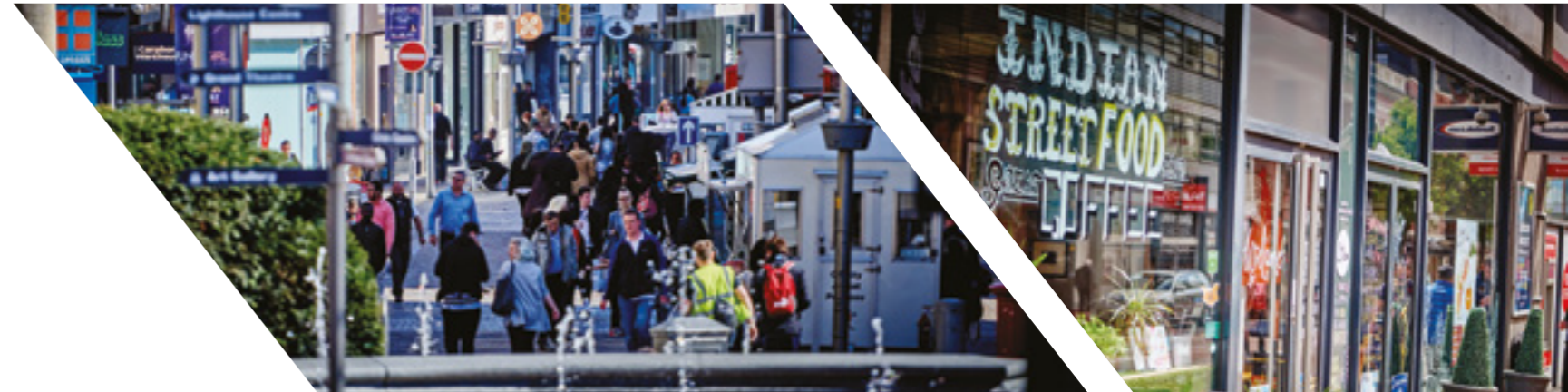
▲ Wolverhampton high street

Right in the heart of the UK, we've got plenty to shout about in Wolverhampton. Whether you're studying at our city centre campus or in nearby Walsall or Telford, there's so much to do and to explore.