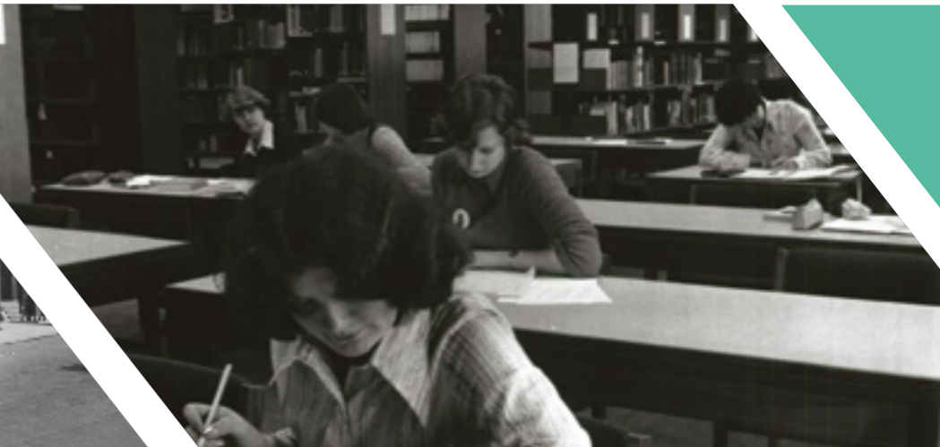
▼ The changing pace of technology