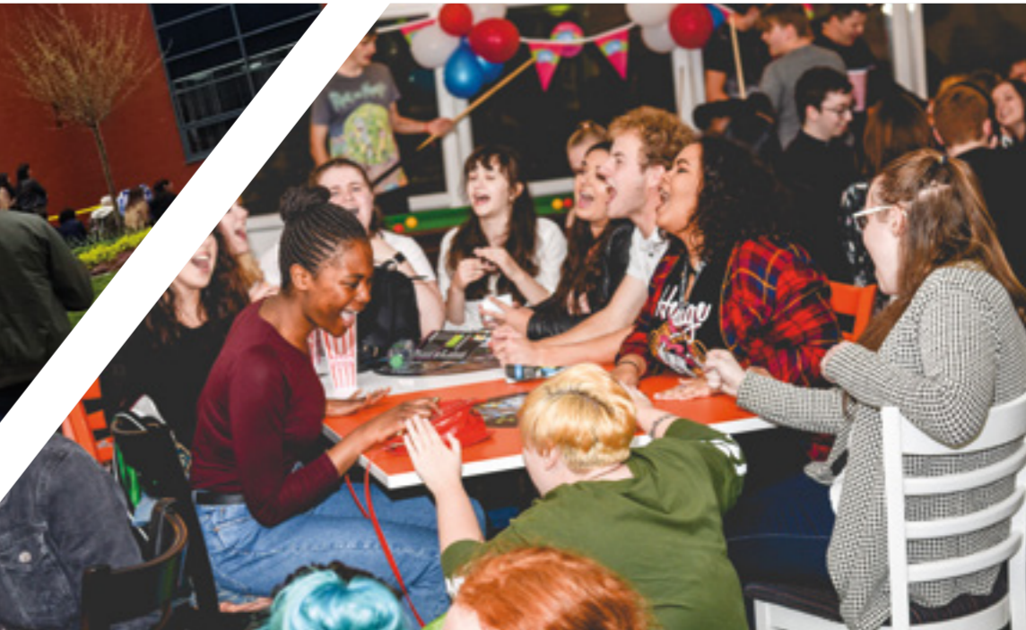
▲ Walsall Students' Union