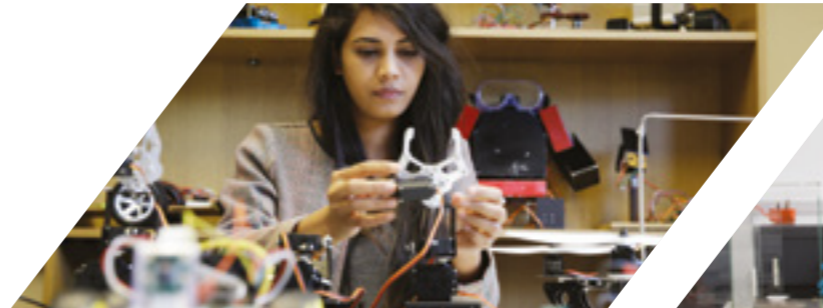
▲ Engineering facilities