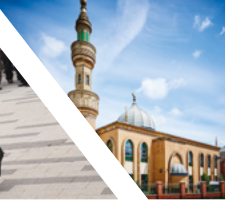
Wolverhampton Central Mosque ▲