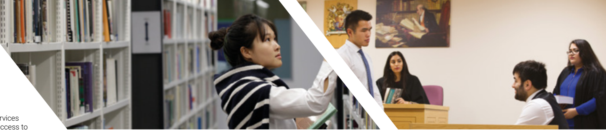
▲ Harrison Library

As well as sports facilities, including a new 3G pitch, Walsall Campus is home to sports labs and a state-of-the-art DXA suite for sport, exercise and health-related research, including bone density testing.