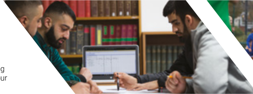
▲ Learning space