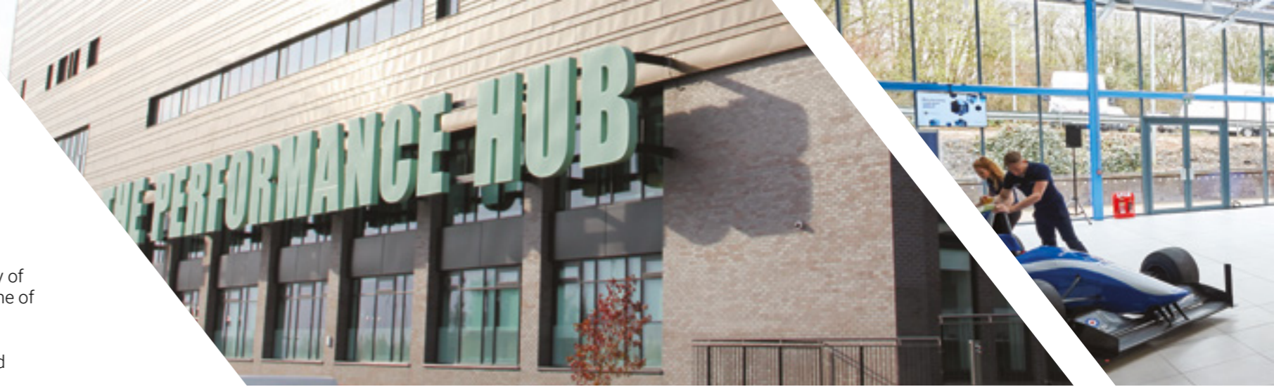
▲ Performance Hub, Walsall Campus

We've also recently invested £10 million at Telford in advanced new engineering facilities and equipment in a number of specialist areas, including motorsport engineering.