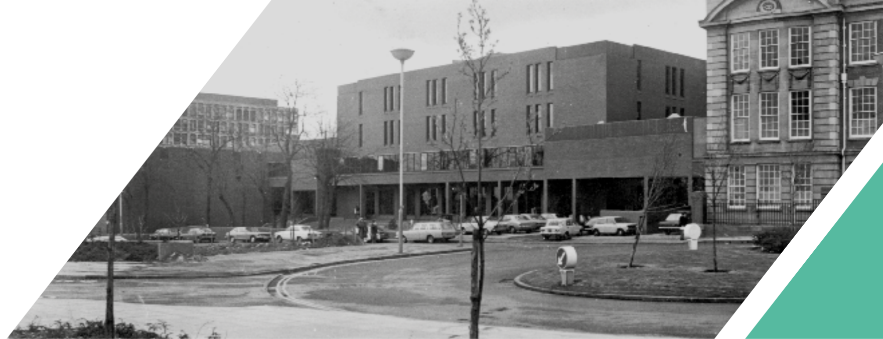
▲ Wolverhampton City Campus pre-Ambika Paul Building

In 1992, Wolverhampton Polytechnic was granted university status and became the University of Wolverhampton. Today, we continue to invest in our students, staff, alumni and in the local and international community with over 4,000 students graduating each year.