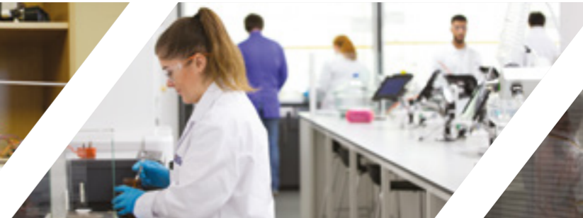
▲ Rosalind Franklin Building labs