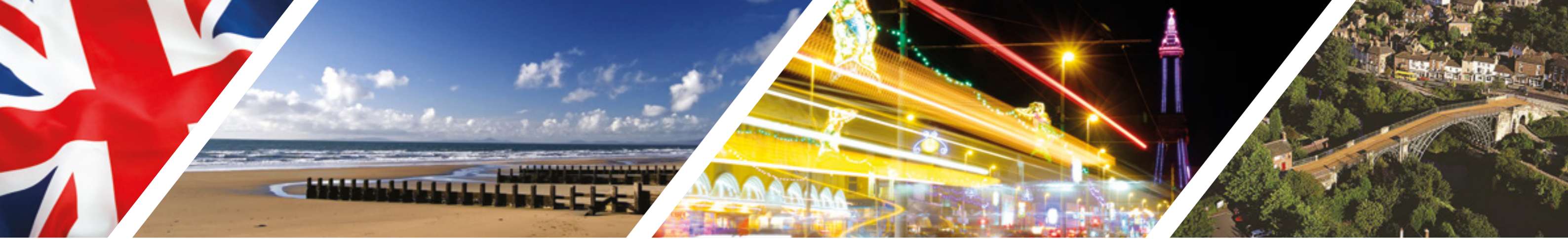
Cardiff, Wales ▼