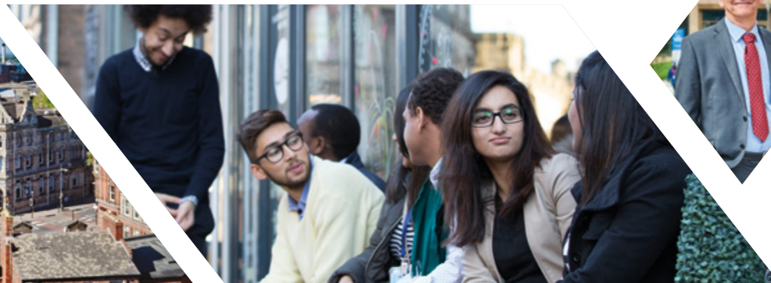
Queen Square ▲