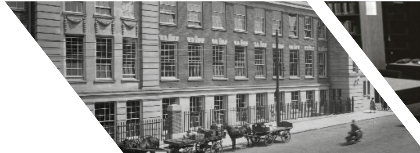
▲ Wulfruna Building