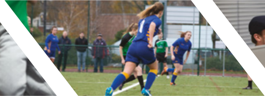
▲ Walsall football pitch