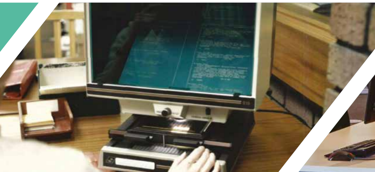
▼ Information searching on microfiche