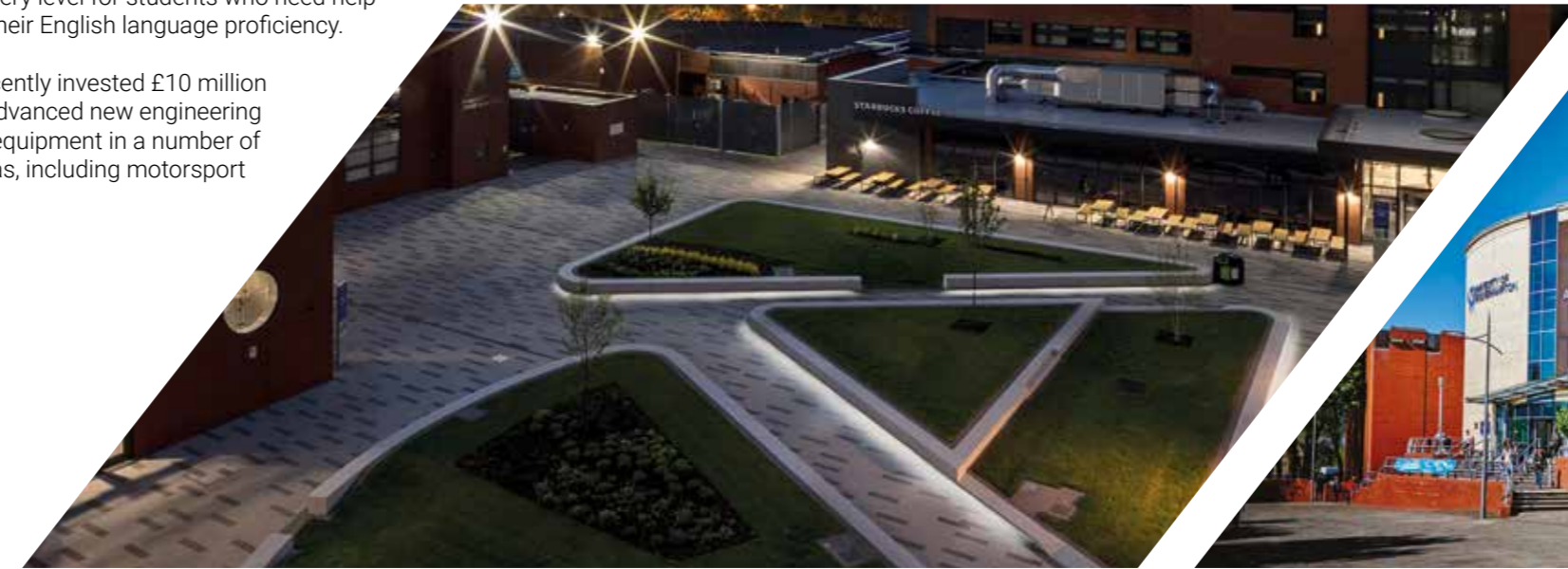
▲ Courtyard, City Campus