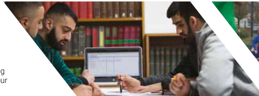
▲ Learning space