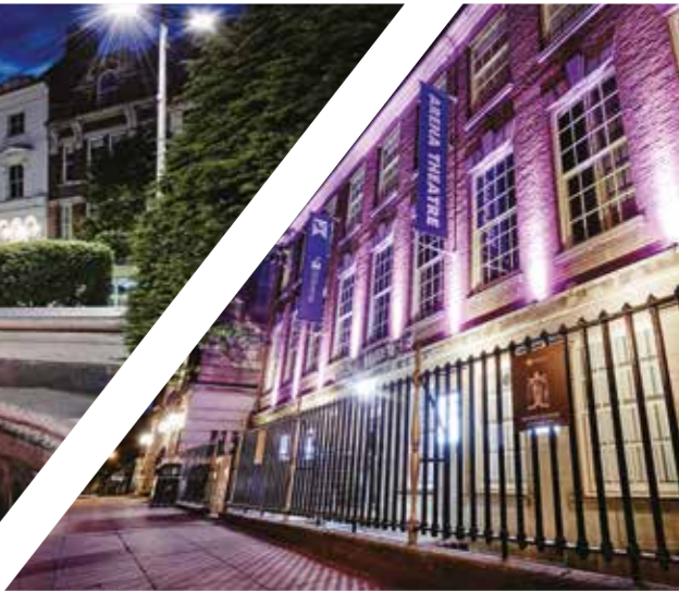
▲ Arena Theatre