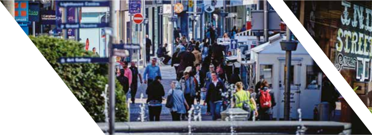
▲ Wolverhampton high street

Right in the heart of the UK, we've got plenty to shout about in Wolverhampton. Whether you're studying at our city centre campus or in nearby Walsall or Telford, there's so much to do and to explore.