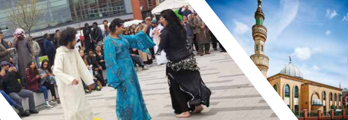
▲ International Fair