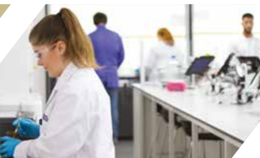
▲ Rosalind Franklin Building labs