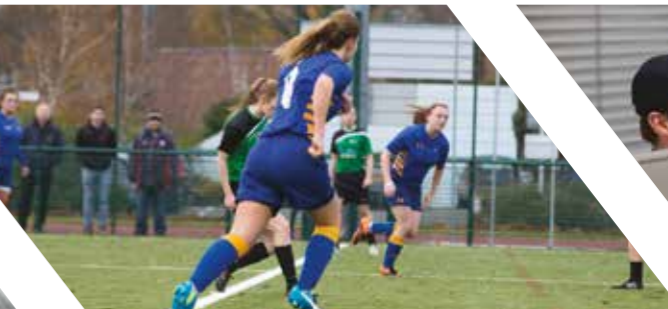
▲ Walsall football pitch