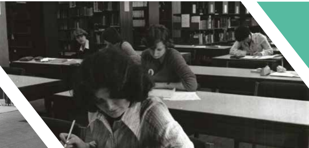
▼ The changing pace of technology