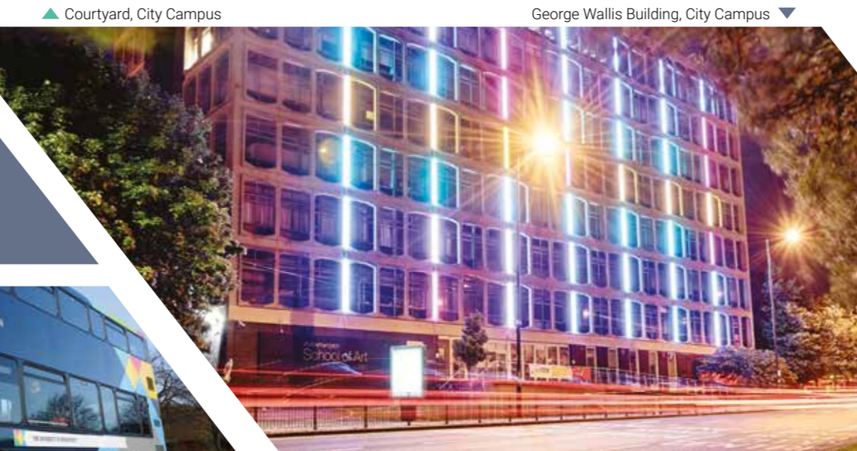
▼ George Wallis Building, City Campus