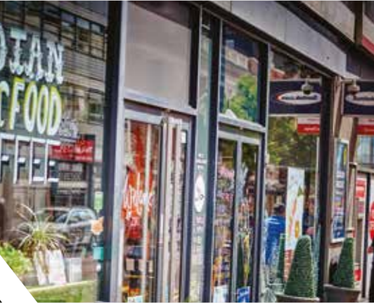
▲ Zuri Coffee