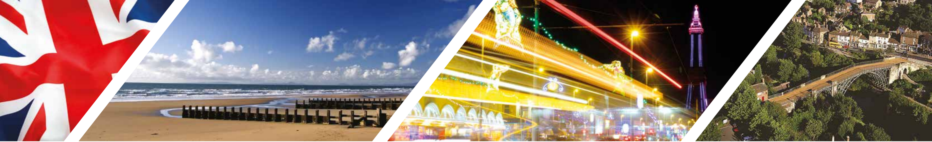
Cardiff, Wales ▼