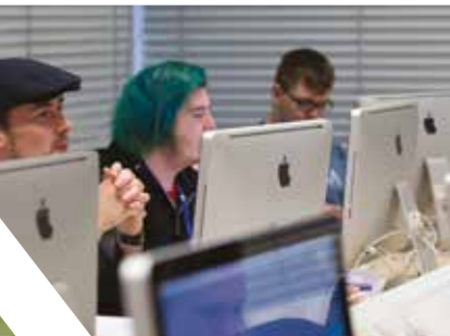
Mac labs ▲