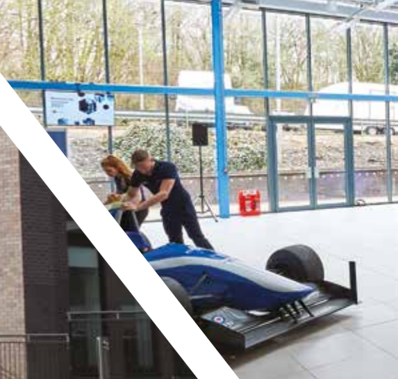
Telford Campus ▲