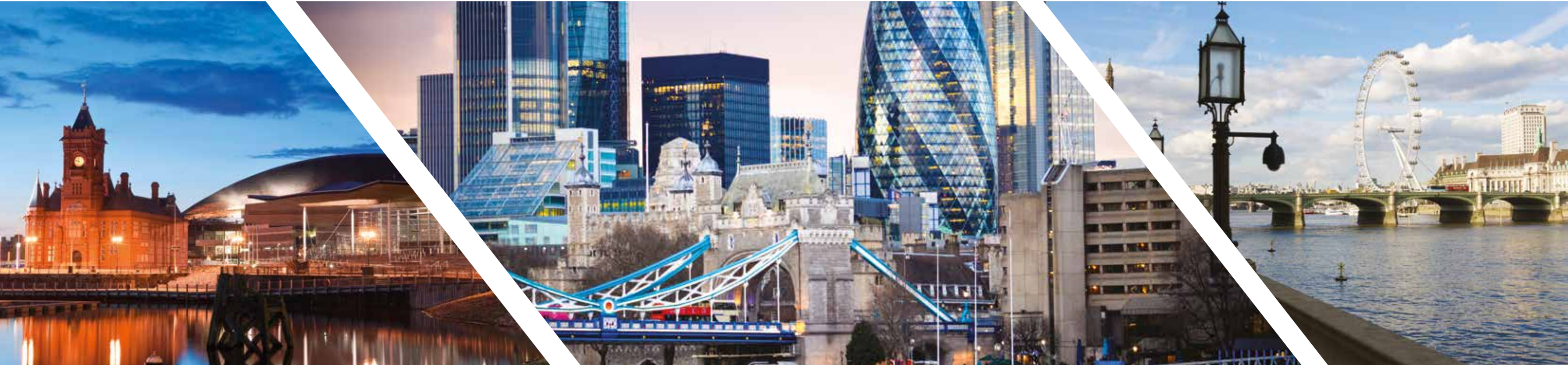
London City Centre ▲