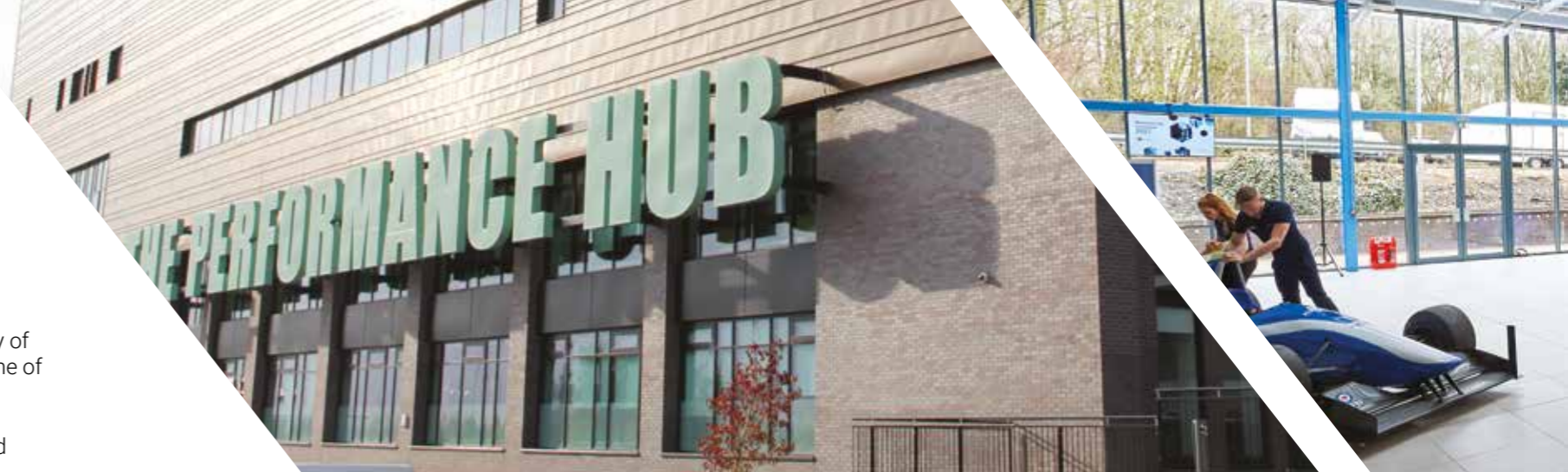
▲ Performance Hub, Walsall Campus

We've also recently invested £10 million at Telford in advanced new engineering facilities and equipment in a number of specialist areas, including motorsport engineering.