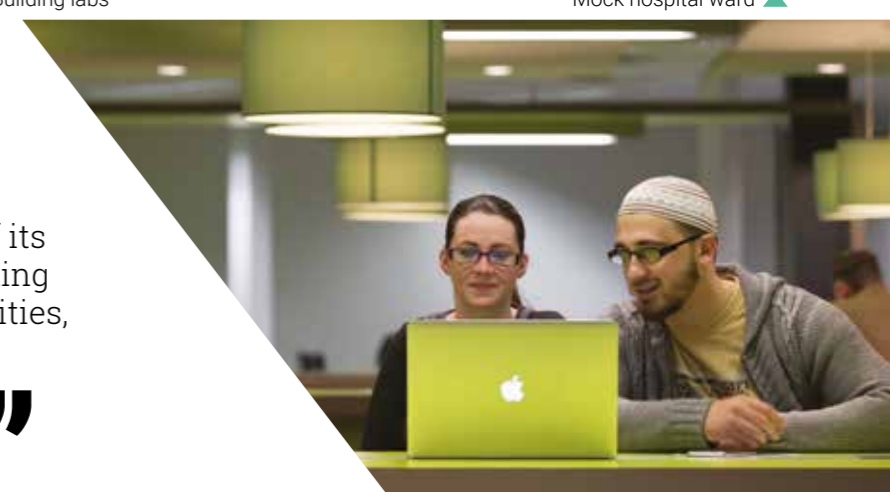
Harrison Library ▲