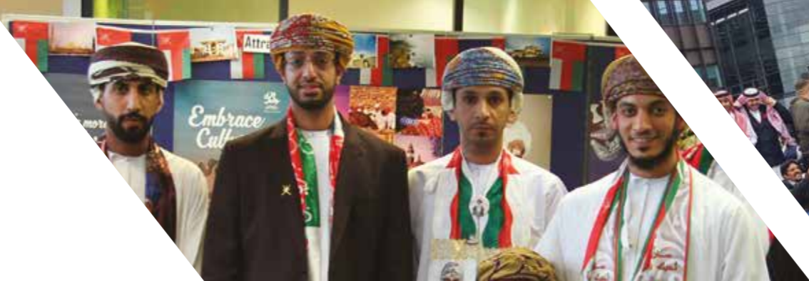
Student representatives from Oman ▲

If you follow a faith or want to explore your spirituality, the city centre's square mile offers churches, mosques, gurdwaras and temples.