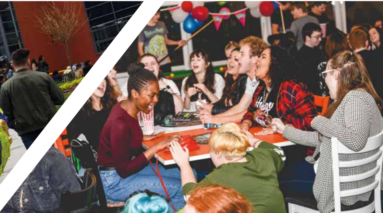
▲ Walsall Students' Union