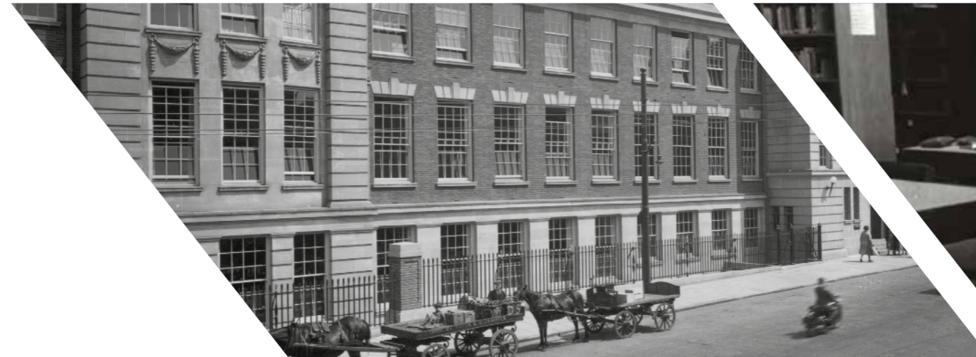
▲ Wulfruna Building